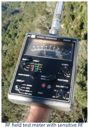
field test meter with sensitive RF cone attachment